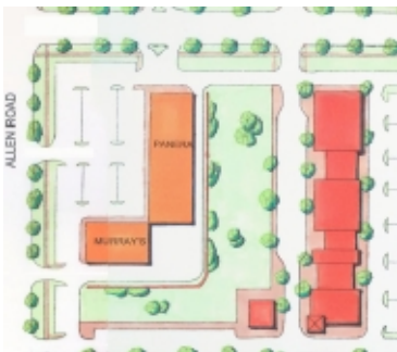
Woodhaven DDA Plan