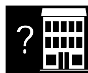
Special Land Use